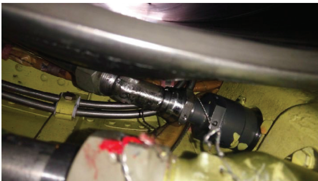
Fig. B – The joint as installed in the SU-30 – This view is within the wing of the aircraft