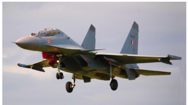
Fig. C – An Indian Airforce SU-30 mid flight.