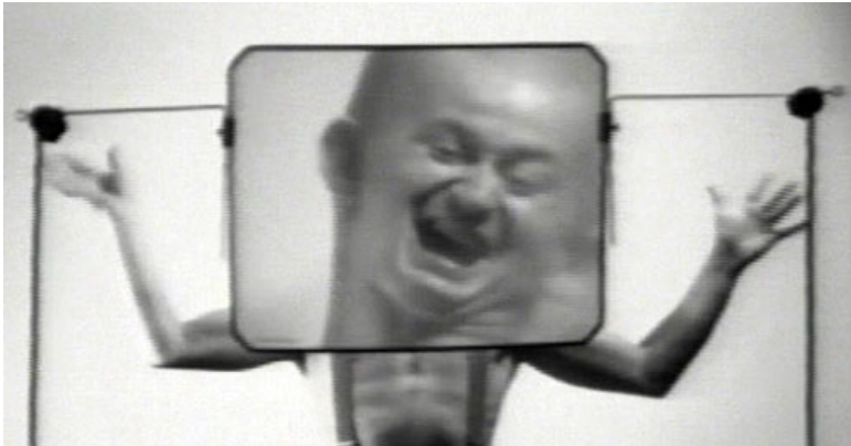
J. Paul Getty Trust